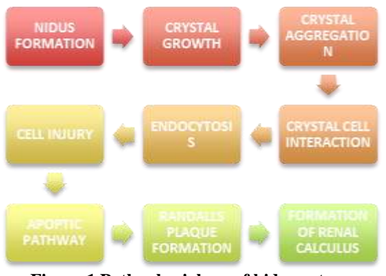
Figure 1 Pathophysiology of kidney stone formation

The most prominent step is the aggregation of grown crystals into large masses. In all the cases of calcium oxalate stones, it retains the aggregated crystals within the kidneys.[21]